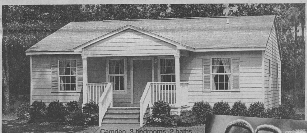
Camden 3 bedrooms, 2 baths

Get into it! Property owners are getting into 100% builder financing.